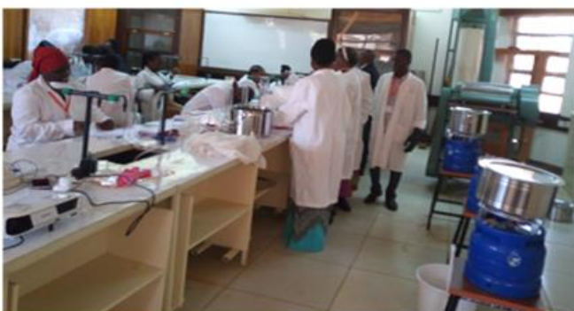
Participants undertaking a practical on dyeing at the Textile Laboratory at Moi University, which was renovated by World Bank through PTRE