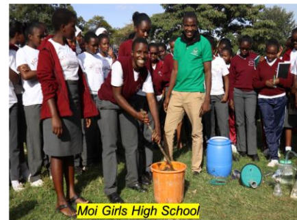
Moi Girls High School