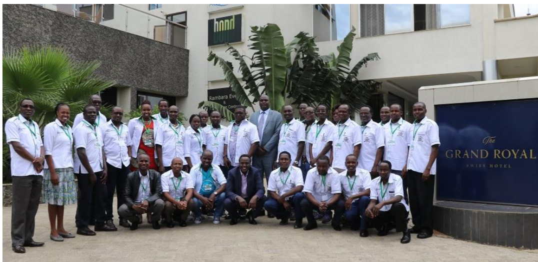
Moi University management, staff and ACEII PTRE team during a self-evaluation Seminar

The ACE II PTRE Center has held three (3) self-evaluation workshops together with Moi University Management, Deans of School of Engineering and School of Biological and Physical Sciences, PTRE Thematic Leaders, Finance officer, Procurement, Acting Chief Internal Auditor and ACE II PTRE team members. During the self-evaluation workshops, the challenges experienced by the Center are discussed jointly and solutions are provided. In addition, joint meetings have been held between ACE II PTRE partners (national and regional partners), ACE II PTRE team members, University Management and University Council to discuss on project implementation progress.