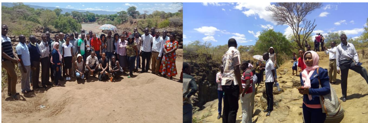
ACE II PTRE team members and student during an excursion at Kerio Valley and Cheploch

Mentoring of students has been done through supporting them to undertake short courses and exchange programs to other institutions within the nation, regional and internationally https://excellencecenter.mu.ac.ke/index.php/2019/05/16/ms-joan-kiptarus-staff-exchange-at-kirdi/ , https://excellencecenter.mu.ac.ke/index.php/2020/07/08/exchange-programme-at-university-of-port-harcourt/ . More mentorship has been offered through integrating students to faculty and partner teams to develop and offer short courses with examples being courses on soap making and application of natural dyes for the textile cottage industry ( https://youtu.be/bvUc2GpOoII ). To enhance the social relationship of students and ACE II- PTRE team members, the Center has undertaken joint activities between students and staff for team building which include excursions, joint dinners and student orientation