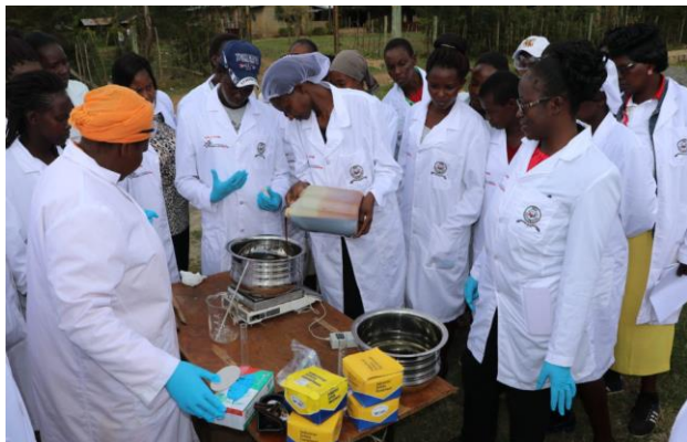
Community members undertaking a practice on soap making

In line with the ACE II PTRE mission to provide, skilled and empowered human capacity in Phytochemicals, Textile and Renewable energy with the potential to develop innovative products of high value and quality, offer services and solutions for the industrial sector, a short course on soap and detergent was conducted to community members of Kesses. The aim of the training was to advance knowledge to the local communities, so that they are empowered and equipped to participate in a socio- economic generating activities. Hence, the local community was empowered on soap and detergent production techniques. Currently during the COVID 19 pandemic period, community members who were trained have been making soap which they have been selling to other members of the community. These community groups will be supported further for their products to receive certification ( https://www.youtube.com/watch?v=jvNDGibch6E&t=122s ).