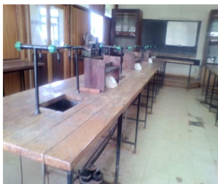
Textile wet laboratory before renovation

The Center has renovated four (4) laboratories that are being used for practical and research by students and researchers. An example a renovated laboratory is the wet lab at the Department of Textile Engineering used for carrying out all practical's requiring chemicals for Textile and Industrial courses that include, extracting and application of dyes from plants and analysis of molecular structures in textile chemicals and substances. The Center has procured equipment for practical's in the laboratory which include: Rotary Evaporator, Compound Microscope with digital camera, Electrical Muffle Furnace for quantitative analysis, Forced Ventilation Oven for analysis of volatile substances in phyto-chemical extracts, Oil bath for temperature controlled analysis, Distillation unit for provision of de-ionized water for analysis, RAMAN Spectrophotometer for Molecular characterization, Hot-press for analysis for color fastness to hot pressing, Metallurgy microscope among others.