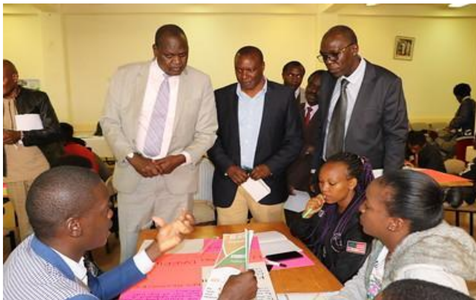
Vice Chancellor Moi University following a presentation by incubates during entrepreneurial boot camps

support infrastructure besides developing an understanding of existing regional business environment and incubation ecosystem and providing access to equipment/tools/facilities and experts in product or service development. Moreover, the IC shall also attract local and international expertise, coaches and mentors to support the incubation process besides showcasing innovations as a strategy for sharing knowledge through expositions and support equity through cultivation of a spirit of inclusivity in IC utilization.