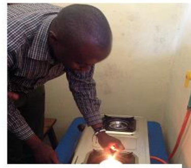
Demonstrations on the ease of lighting a biogas cook stove and its cleanliness