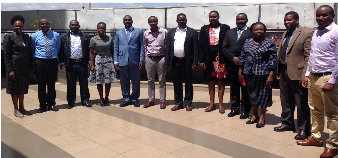
Participants from Moi University ACE II-PTRE, partners including Kenya association of Manufacturer, Kenya Industrial Research and Development Institute, RIVATEX, FLEXI BIOGAS INTERNATIONAL, NOCART, KEBS and a Community representative during the 2 nd Center industrial linkage committee meeting

There is need for universities to introduce innovative competent-based learning models in order to improve the graduates' employability, enhance their capacity to adapt to the constantly evolving working environment and to develop expertise that meets the labor market demands. There is a great potential to achieve this goal if there are strong linkages between universities and the private sector/industry. To address this knowledge and skills gap between University and Industry, the ACE II-PTRE formed the Center Industrial linkage committee. This committee has held three (3) industrial meeting since inception. The meetings have brought together partners including: KAM, KIRDI, RIVATEX, FLEXI BIOGAS INTERNATIONAL, NOCART Africa and Community representatives to undertake joint discussions and plan for needed interventions. Also, the industrial linkage committee has organized and held joint workshops with students and faculty members to share on areas that the private and public sector need work on jointly with the University. These joint workshops have helped encourage students and staff to take part in the ongoing researches within the industry and develop joint publications.