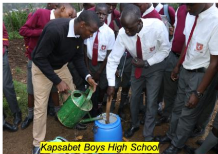
Kapsabet Boys High School