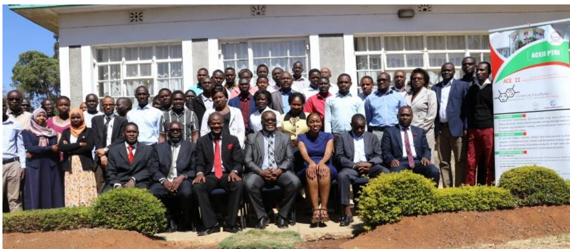
Postgraduate students from School of Engineering and School of Biological Science, Faculty staff, Director School of Postgraduate studies, private and public sector partners during a workshop on Promoting University Partnership with Industry to build Collaborative Research Capacity and Solve Developmental Challenges in the Society