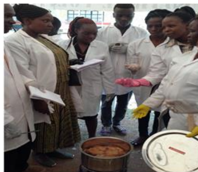
Participants carrying out natural dyeing process during training exercise