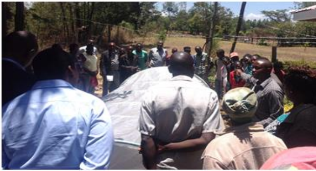
Participants following a presentation at Kesses on feeding of the biogas digester and working of the biogas unit