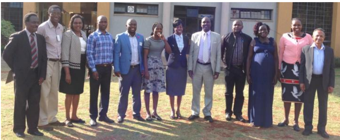
Moi University team during the TEA-LP workshop in Nairobi, August 2019

The TEA-LP project was launched during a workshop held in August 2019 in Nairobi. This workshop aimed to develop a shared understanding of the TEA-LP principles and goals, share knowledge and expertise, as well as to network and develop relationships. Present at the workshop were several organizations working in the sector who offered their insights and reflections on skills needs. They included MECS, AMI and Energy4Impact.