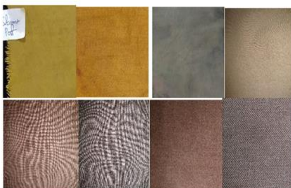
Initial Results in Pictures

Prosopis juliflora commonly known as mathenge is a noxious and invasive plant occupying majorly arid and semi-arid regions of Kenya. When the pods of the plant are eaten by livestock especially sheep and goats, they lose teeth and in some cases die due digestive tract complications. The heartwood of the plant is reddish in colour and is full of antioxidants/ flavonoids such as mesquitol, catechin, and epicatechin among others. Because most yellow and brown natural dyes are flavonoids, it gave a guide to extract some natural dyes from the heartwood of the plant. This extraction was successful and gave 4 reliable dye shades with varying stabilities. Post mordanted samples were the most stable with the highest fastness. Dyeing was done at the Moi University labs at the School of Sciences and Aerospace studies lab and fastness tests were done at the RIVATEX Textile Labs, a facility of Moi University.