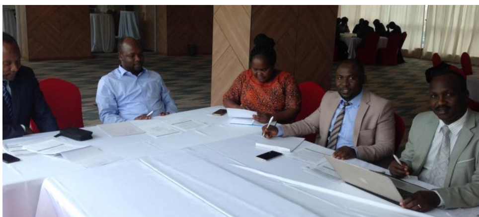
Breakout session during ENA workshop, January 2020

Moi University TEA-LP team organized a stakeholders' workshop that was held in Nairobi on 17 th January 2020. This was an opportunity for stakeholders to clarify important sector needs and provide inputs on how best to implement the proposed master's program. The data and information obtained from the workshop informed the curriculum structure for the new Master's programme.