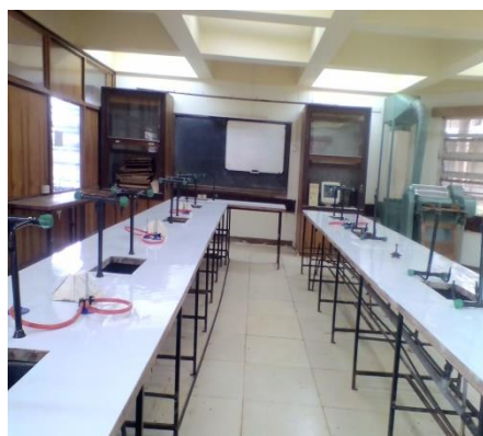
Textile wet laboratory after renovation