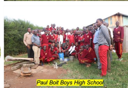
Paul Boit Boys High School

Biogas training for selected high schools from Uasin Gishu, Nandi and Elgeyo Marakwet Counties