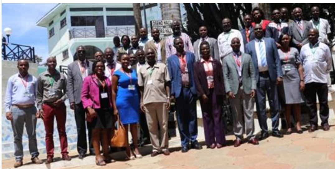
ACE II PTRE national and regional partners, ACE II PTRE team members, University Management and University Council during a joint project meeting.