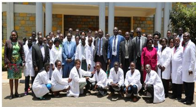
Invited guests from Moi University, Trans - Nzoia County and participants during a natural dye short course training held in Kitale National Polytechnic from 1st – 5th April, 2019