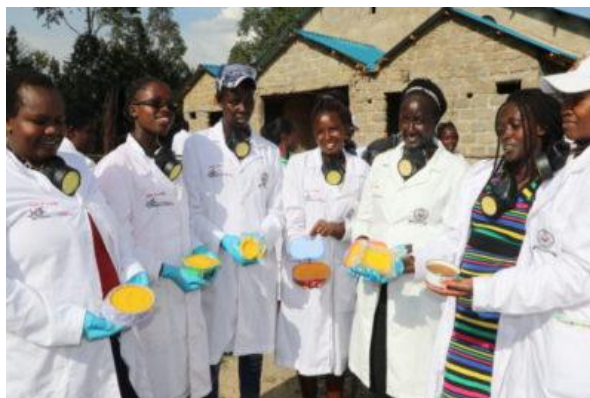
Community members displaying soap made during the training exercise