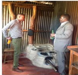
Farmer's kitchen showing a traditional cook stove and wall covered with soot from smoke which is a health hazard to the inhabitants