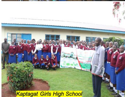
Kaptagat Girls High School