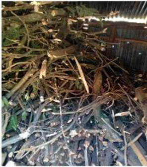
Farmers store in Kesses filled with firewood used to feed the traditional cook stove. This enhances deforestation