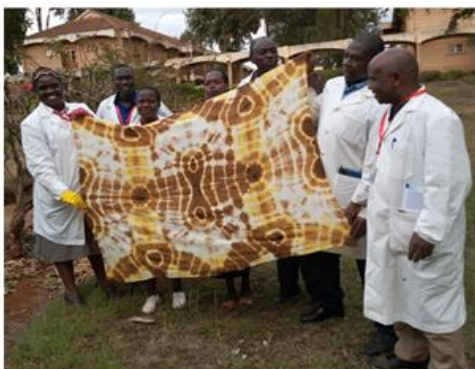
Participants displaying a fabric dyed using natural dye extracted from Itula tree ( Commiphora africana )