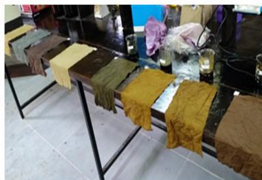
Shades so far obtained are Khaki, Jungle green, dark brown and mid khaki